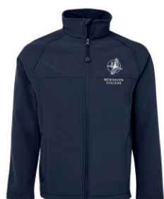
Soft Shell Jacket