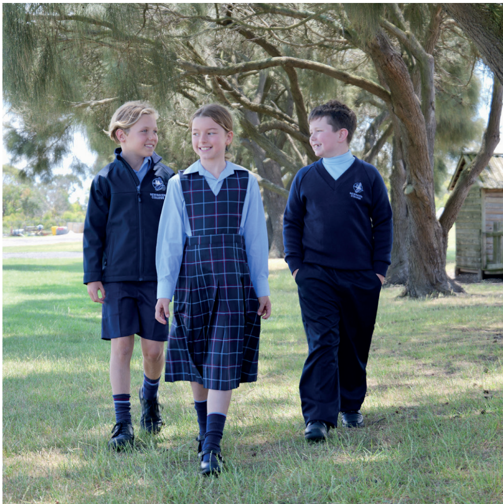
Junior School uniforms are designed to reflect older students' uniforms while allowing for comfort and movement