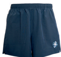
Navy Sports Shorts