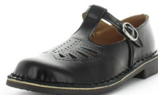
T-Bar School Shoe