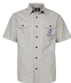
Short Sleeved Shirt