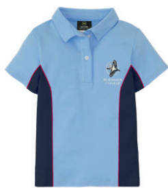
Polo Sport Shirt