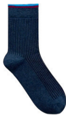
Girls short navy socks