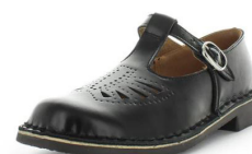
T-Bar School Shoe