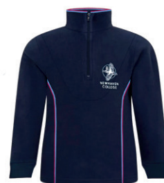
Junior Fleecy Rugby