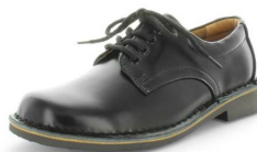
Black Lace up School Shoe