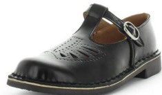
T-Bar School Shoe