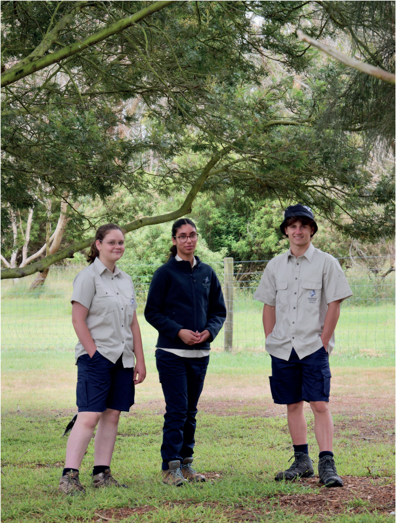
The Year 9 uniform is specially designed for outdoor activities, providing comfort and ease of movement