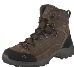
Brown Hiking Boot Year 9 Shoe