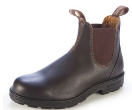
Brown Blundstones Year 9 Shoe