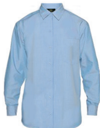
Long Sleeved Shirt (Classic and tailored fit)