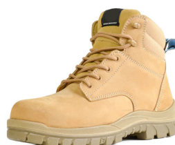
Timberland Style Boot Year 9 Shoe