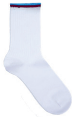
Girls short white socks