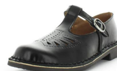
T-Bar School Shoe