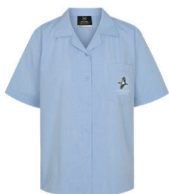
Short Sleeve Shirt (Classic and tailored fit)